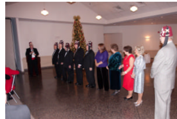
2011 Installation of Officers